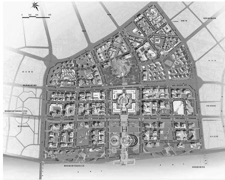
Figure 2 Qiangjiang CBD master plan